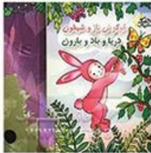
Khargooshe naz o sheytoon... (author and illustrator) audio book