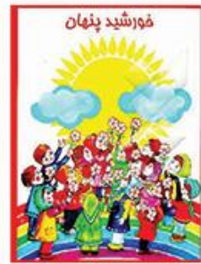
Khorshide penhan (author and illustrator)