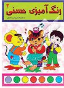
Rangamizi Hasani 2 (author and illustrator)