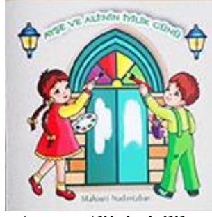
Ayşe ve Ali'nin iyilik günü (author and illustrator)