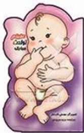
Azizam tavallodet mobarak (illustrator)