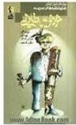
Khodnevis talayi (author)