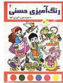
Rangamizi Hasani 4 (author and illustrator)