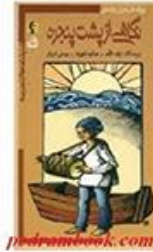
Negahi az poshte panjere (author)