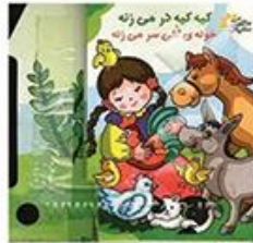
Kiyeh kiyeh dar mizane... (author and illustrator) audio book