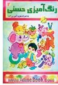
Rangamizi Hasani 3 (author and illustrator)