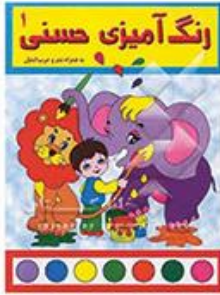
Rangamizi Hasani 1 (author and illustrator)