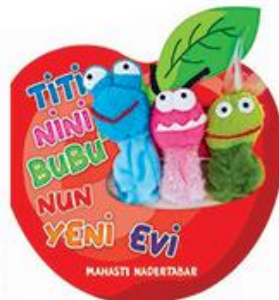
Titi, Nini ve Bubu Nun Yeni Evi (author and illustrator and puppet designer) published by ALTIN publication in Istanbul

The apple shape book has been published in Istanbul. It is a puppet book. (2018)